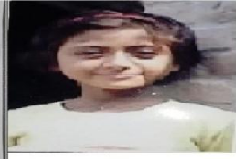
Fir.59,Us 363 Sadar Sumundri (مٹی ٹورین بچہ 7 سال)