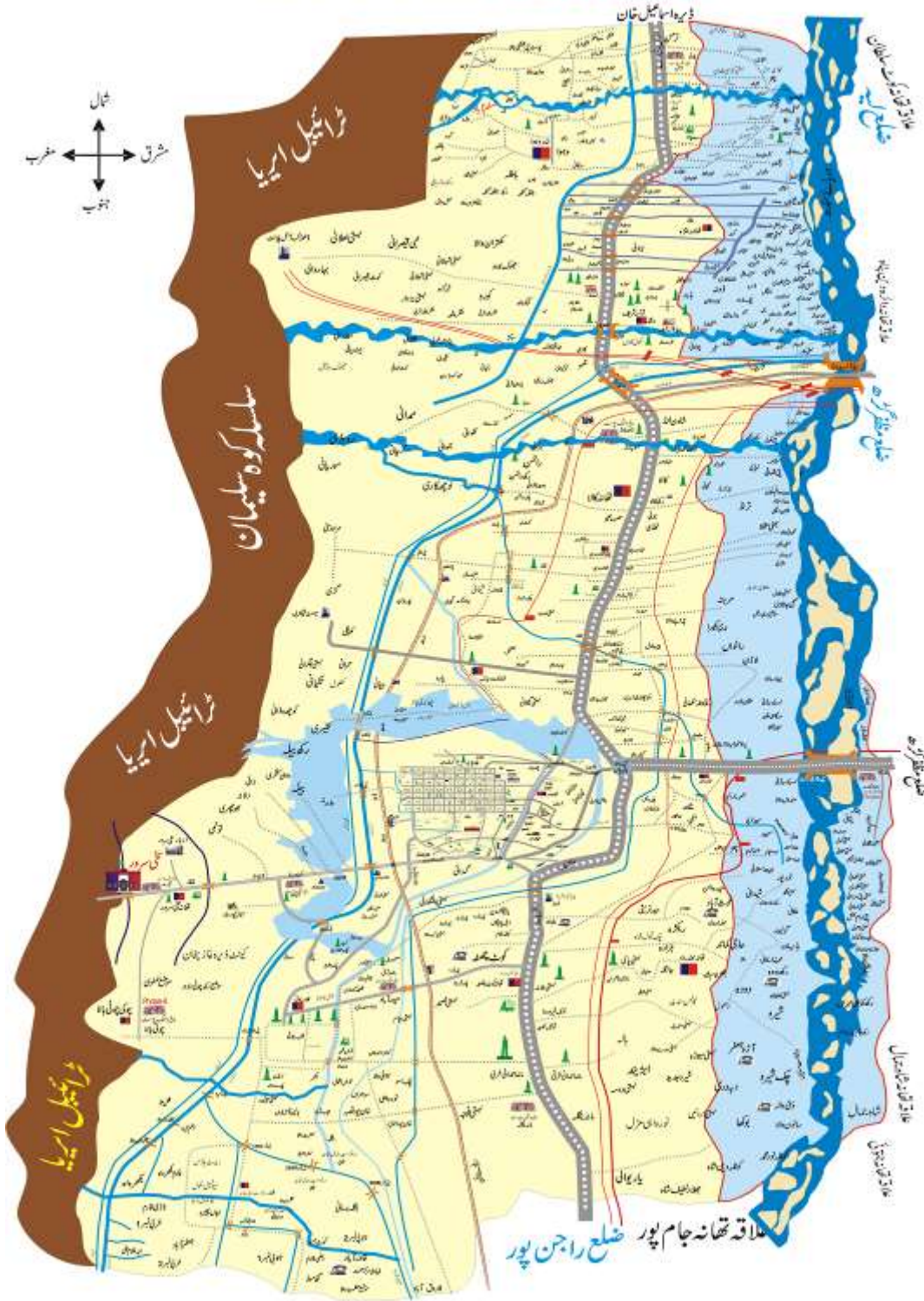
علاقہ تھانہ داخل